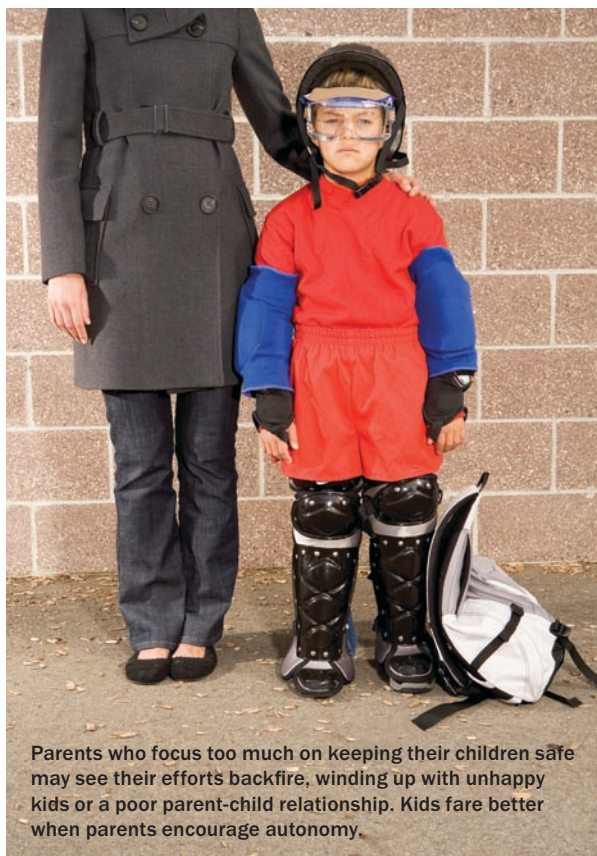
Parents who focus too much on keeping their children safe may see their efforts backfire, winding up with unhappy kids or a poor parent-child relationship. Kids fare better when parents encourage autonomy.

Tempering one's parenting with relevant scientific knowledge can truly have great benefits for one's family. It can reduce