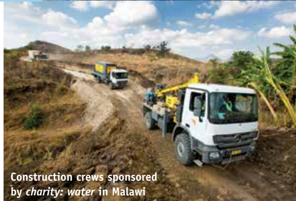
Construction crews sponsored by charity: water in Malawi

think about this dream on her trips to get water. The chore often took hours. First there was the walk. Then there was the hours-long wait in line at one of three shallow holes dug into the dried-up streambed where villagers gathered their water.